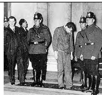
Photographs of Van der Lubbe with a box of matches, taken by police when he was in custody